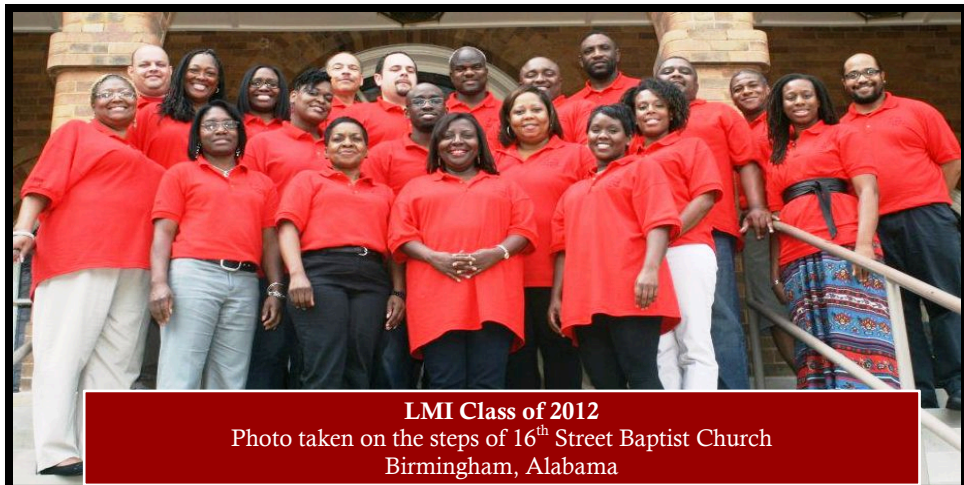
LMI Class of 2012

Twenty-one higher education administrators and faculty members traveled from across the nation to participate in the 9 th Leadership and Mentorship Institute (LMI) co-sponsored by Miles College and the American Association of Blacks in Higher Education (AABHE) at Miles College in Fairfield, Alabama, July 15-22, 2012. Congratulations to the LMI Class of 2012 on their successful completion of the Institute!