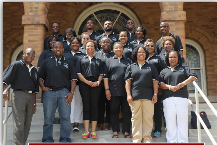
Class of 2015 Picture taken in front of 16 th Street Baptist Church Birmingham, Alabama

Please recommend your friends, colleagues, and talented staff to apply for LMI by directing them to our website: http://lmiexperience.org/ . The application process is 100% on-line via the LMI website.